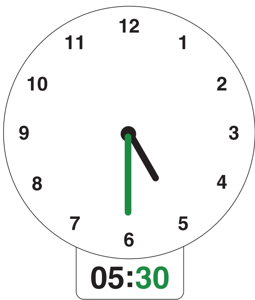
Koroio ko rima i te vaega