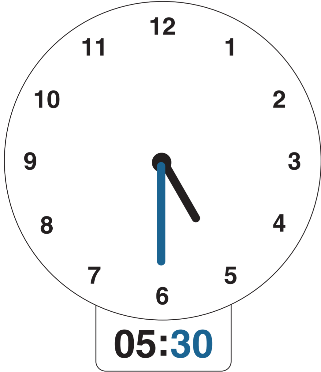
Hora mihe e te 'āfa