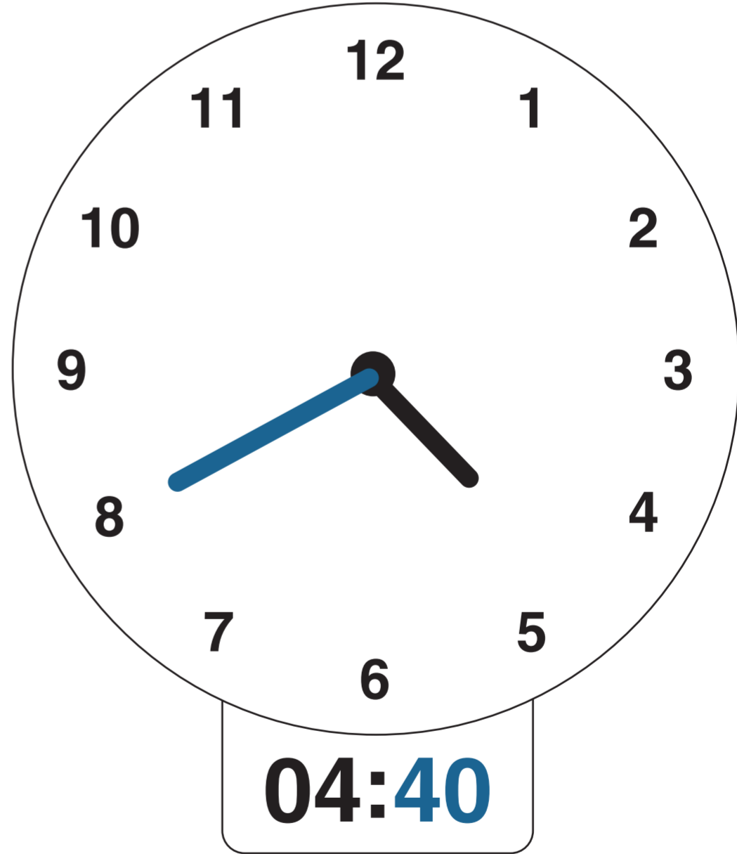
Ite gahuru miniti toe e hora mihe ai